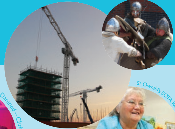
The Damned - Christmas 2010

Chair of the Gloucester Partnership Strategic Group and Leader of Gloucester City Council