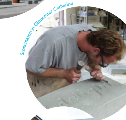
Stonemason in Gloucester Cathedral