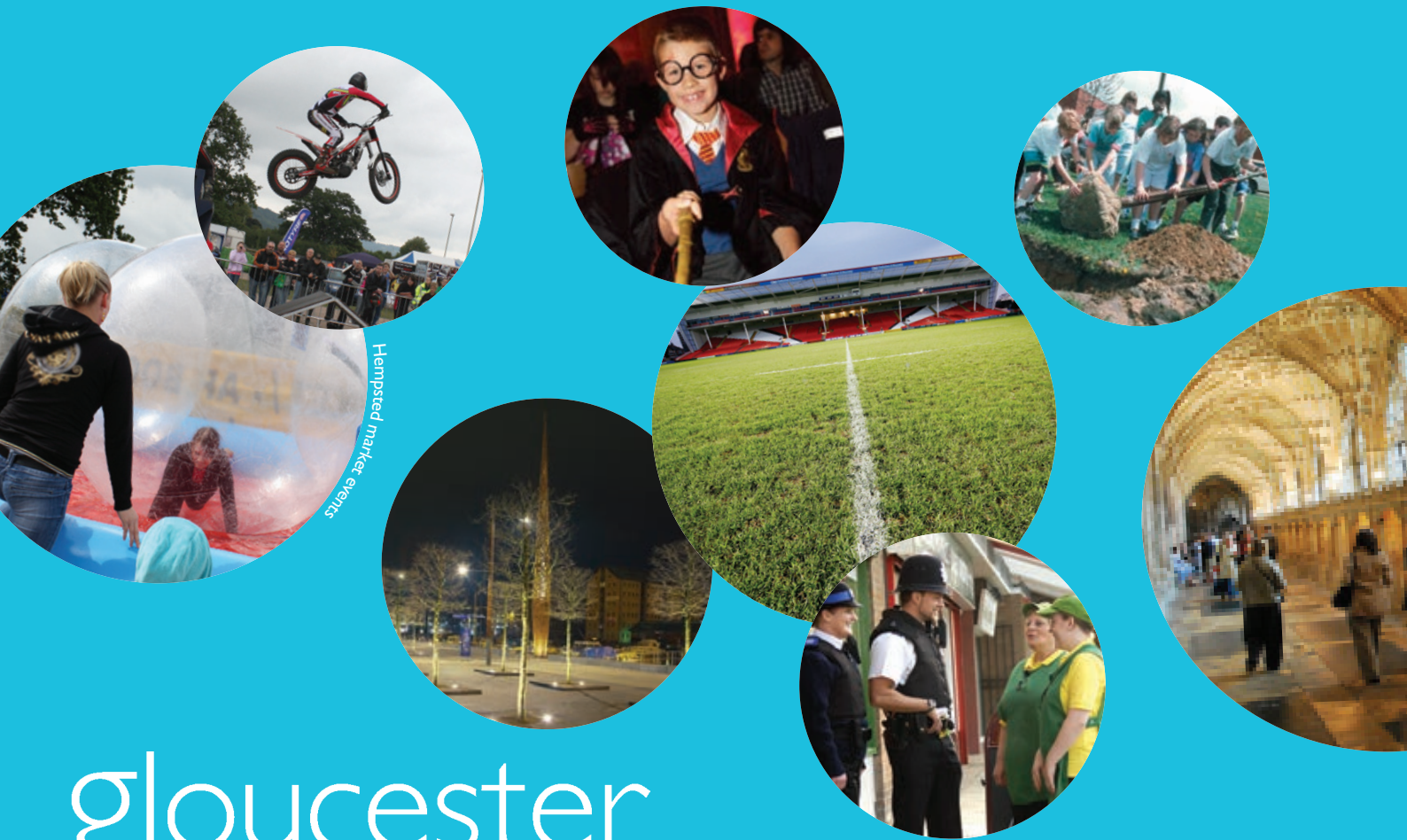
Hempsted market events