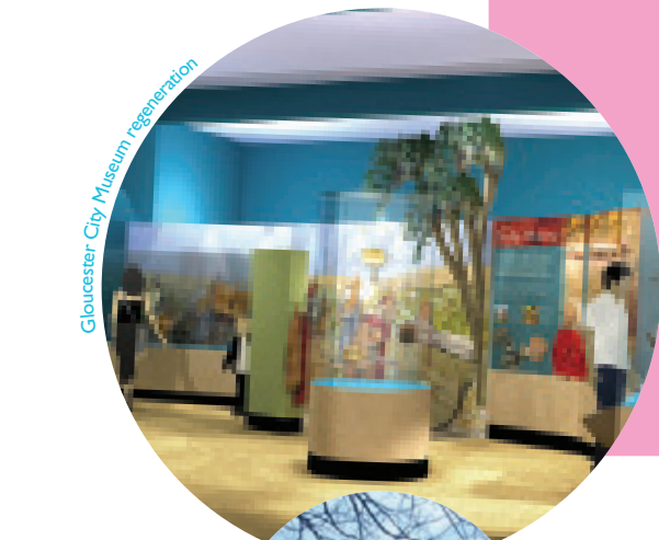
Gloucester City Museum regeneration