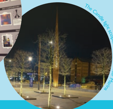
The Candle light sculpture - Gloucester Marina