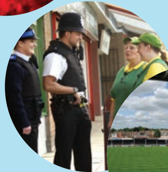
Westgate Street - Gloucester City Centre