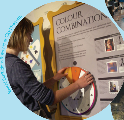
Special Exhibitions & events at City Museums