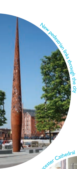
New pedestrian links through the city